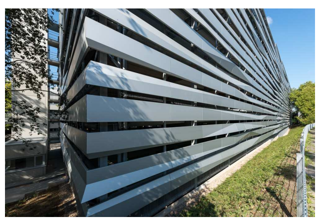
View from south-east

AMP was commissioned to design a user-friendly car park, accommodating current parking bay dimension standards and produce a structure that would complement the urban fabric. The facade was the subject of an architectural competition which was won by Hartig Wömpner Architects. Post building application, a general contractor tender was submitted. AMP was appointed to carry out quality-control services and site supervision.