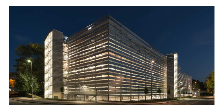
Night view from north-west

Client: BLB Bau- und Liegenschaftsbetrieb NRW