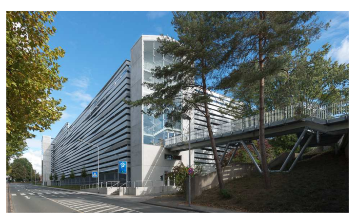
View from south-west