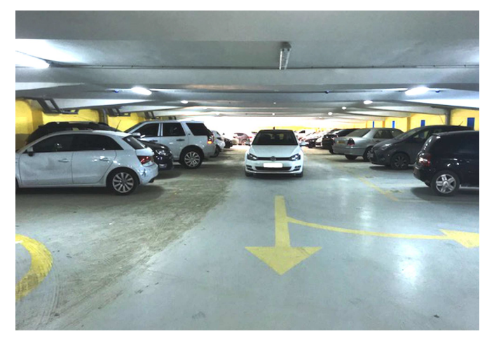
Vehicle lane